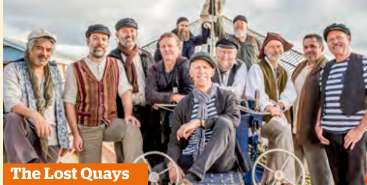
The Lost Quays

Bluegrass Parkway, from W.A., is Australia's most highly credentialed and experienced bluegrass band. The band places a high priority on presenting bluegrass in its most authentic traditional form; e.g., performances take place around a single microphone. Another feature of the band is the very entertaining on-stage repartee that takes place between band members