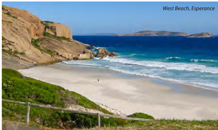
West Beach, Esperance

Travel to Esperance. Stop at Lake Lefroy, a salt lake 55 kms south of Kalgoorlie-Boulder. Stop in the historic town of Norseman, about halfway between Esperance & Kalgoorlie. Visit Cape Le Grand National Park, 56 kms east of Esperance (beautiful white-sand beaches & coastal scenery). Arrive in Esperance, where 'the golden outback meets the Southern Ocean and a string of stunning white-sand beaches'. Panoramic coach tour of the town. Also drive the 38 km circular loop Great Ocean Drive, to the west of town, which includes Twilight Beach, Rotary Lookout, wind farms, Observatory Point and the Pink Lake. Evening: Enjoy dinner and a relaxing evening in our motel. Overnight: Bay of Islands Motel. (B,D)