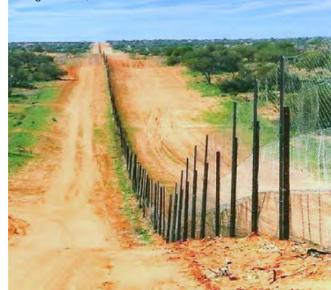
Dingo Fence, outback South Australia

Morning: Visit Burke's Grave and the beautiful Cullyamurra Waterhole, both a few kilometres east of our hotel. The scenery along Cooper Creek, in the vicinity of Innamincka, is stunning. Beautiful water holes, fabulous gum trees, and lots of colourful Australian birds. Then visit the famous Dig Tree, where on May 22, 1861, Burke, Wills and King probably realised they were doomed. Afternoon: You will have some free time. You may like to visit the former Australian Inland Mission Hospital building, now a National Parks office and museum, located right next to our hotel. Late Afternoon: Further exploration of Cooper Creek. Travel to the west of our hotel, including a visit to King's Marker (marks the spot where King was found alive by a search party following the Burke and Wills expedition). Evening: Enjoy a fun-filled Aussie Campfire Singalong, in the beer garden of our hotel. We will invite the locals to join us. (B)