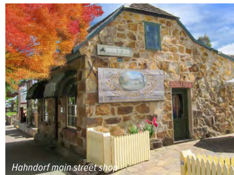
Hahndorf main street shop

Return to Melbourne, arriving approximately 6.45pm and the tour concludes. (B)