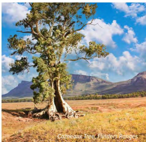
Cazneau Tree, Flinders Ranges