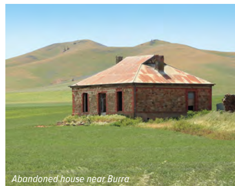
Abandoned house near Burra

This morning we travel south, heading for the Barossa Valley. Along the way we visit historic Burra, once a booming copper mining town. After a tour of the town you may like to sample one of the delicious local Cornish pasties, for lunch. Continue on to the Barossa Valley, one of Australia's premium wine growing regions. After a panoramic tour of the district we will visit a well-known winery. Then check into our accommodation, in Nuriootpa, one of the Barossa's main towns. Evening: Attend a concert/rehearsal by the Marananga Brass Band. The Barossa Valley, with its German heritage, is famous for its