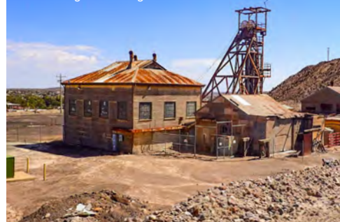
Old buildings at mining site in Broken Hill