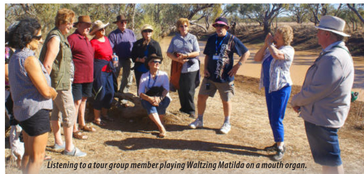
Listening to a tour group member playing Waltzing Matilda on a mouth organ.

Morning: Travel to Longreach. Spend some time in historic town of Ilfracome. See historic Langenbaker House (former teamster's cottage); visit the Wellshot Centre (tells the story of one of Australia's greatest sheep stations...Wellshot Station); visit the Machinery Mile (outstanding display of tractors & farm machinery). Afternoon: Free time in Longreach's town centre. Make sure you visit The Station Store (lots of excellent outback leather goods, souvenirs, etc.). Also enjoy a 45-minute ride in a