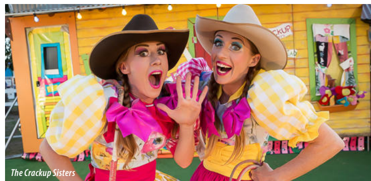
The Crackup Sisters