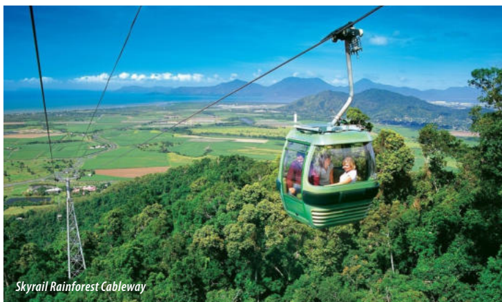
Skyrail Rainforest Cableway

Late morning you will be transferred to Cairns Airport for your flights home. (B)