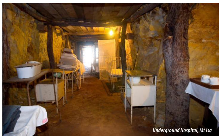
Underground Hospital, Mt Isa