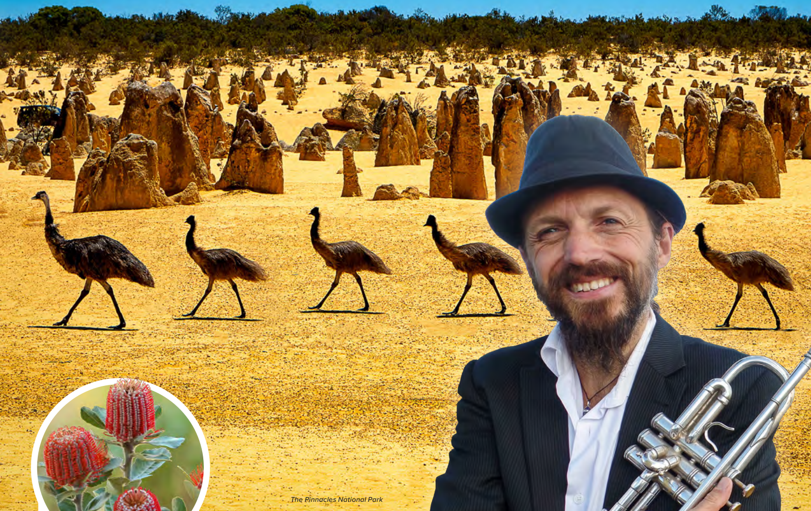
The Pinnacles National Park

Visiting Perth, Fremantle, Rottnest Island, Margaret River, Pemberton, Albany, Esperance, Hyden (Wave Rock), and The Pinnacles