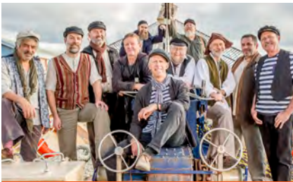
The Lost Quays

The Lost Quays is a well-known 10 voice male vocal group, from Fremantle, that performs sea shanties and other songs of the sea! The group performs both a cappella (unaccompanied) and with a sprinkling of guitar, mandolin & concertina. The Lost Quays perform with energy and good humour and relish a strong audience connection. As well as traditional & nautical folk material, from around the world, the group also performs some original material.